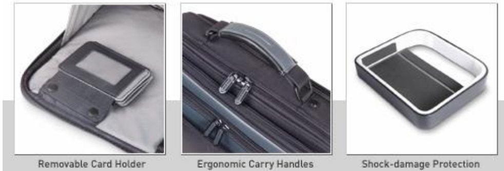
Removable Card Holder